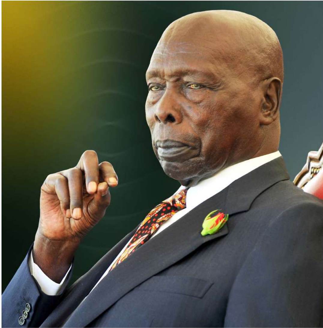
H.E Daniel T. Arap Moi, CGH 2 ND PRESIDENT OF KENYA FOUNDER, KABARAK UNIVERSITY